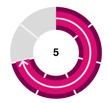
Larger values (up to 7) indicate higher risk while lower values (up to 1) indicate lower risk.