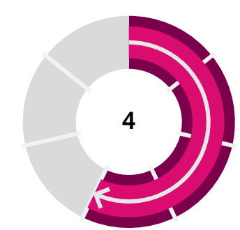
Larger values (up to 7) indicate higher risk while lower values (up to 1) indicate lower risk.