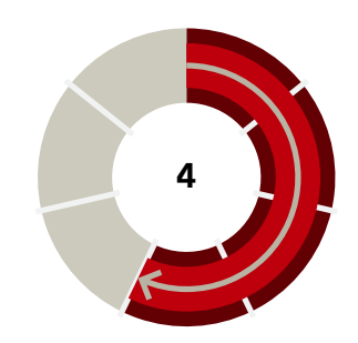
Larger values (up to 7) indicate higher risk while lower values (up to 1) indicate lower risk.