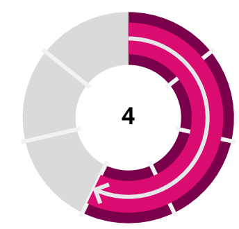
Larger values (up to 7) indicate higher risk while lower values (up to 1) indicate lower risk.