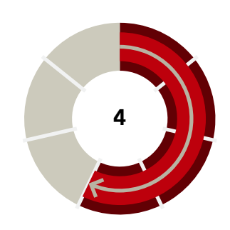
Larger values (up to 7) indicate higher risk while lower values (up to 1) indicate lower risk.